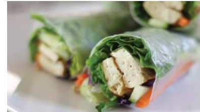
V3. Spring Rolls (Served with Peanut Sauce)