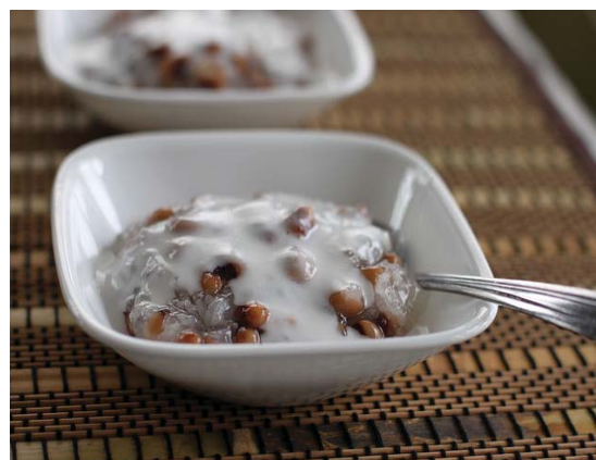
Dessert of the Day

Sweet rice and black-eyed peas topped with creamy sweet coconut milk • 3.5