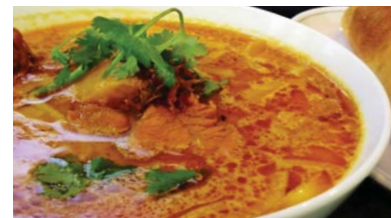
R7. Chicken curry