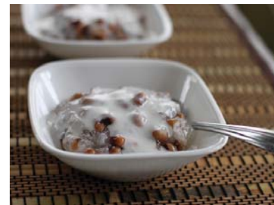
D1. Dessert of the Day