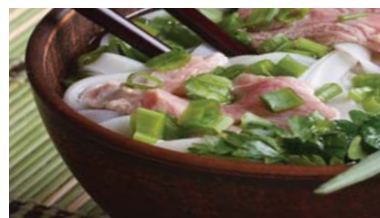
P1. Pho Filet House Special