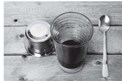
D2. Café Den