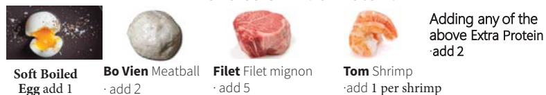
Soft Boiled Egg add 1 Bo Vien Meatball add 2 Filet Filet mignon add 5 Tom Shrimp add 1 per shrimp

Adding any of the above Extra Protein add 2