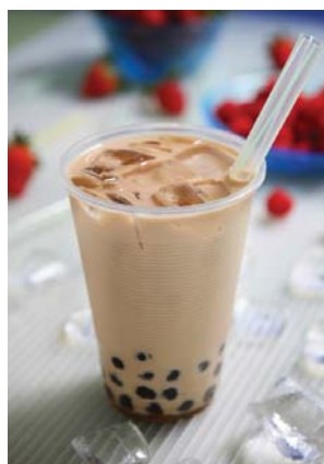
D7. Coffee Boba