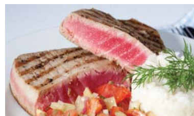
Delicately seared sashimi grade Ahi Tuna 8oz steak garnished with Goji Berries, grilled onion and serve with fresh salad & brown rice.