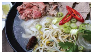
P2 Pho Dac Biet Combination Special