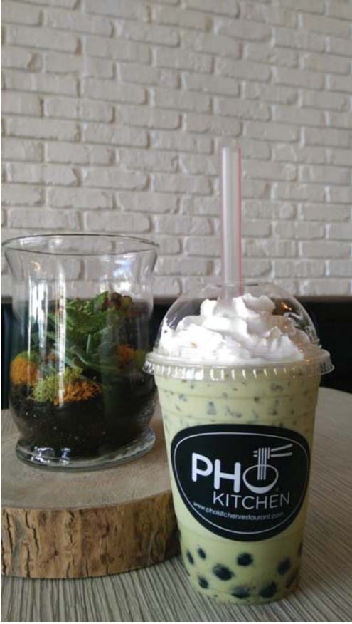
Matcha Milk Tea