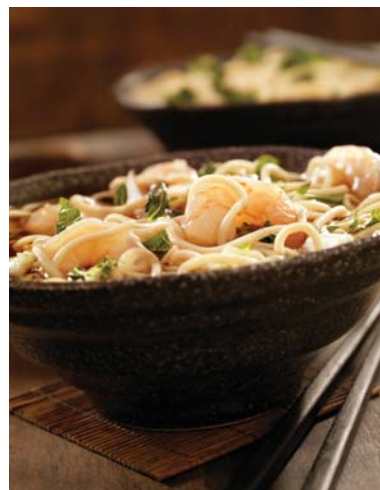
M1 Shrimp Egg Noodles