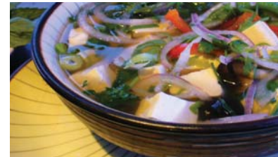
V1. Vegetarian Pho