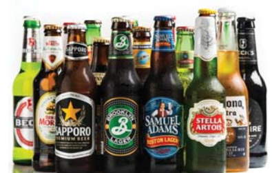
D0. Iced Cold Beers

Consuming raw or undercooked meats, poultry, seafood, shellfish, or eggs may increase your risk of foodborne illness, especially if you have certain medical conditions