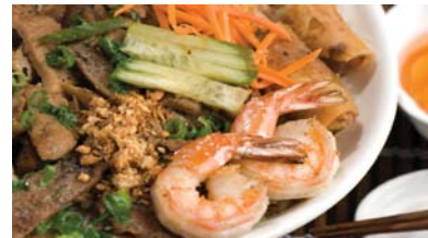
R3. Bun 3 Items Custom (BBQ Shrimp, Pork & Eggrolls)