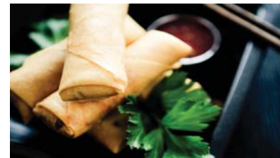
V4. Vegetarian Egg Rolls