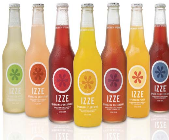
Sparkling Juice 3