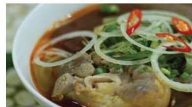
R8. Spicy vermicelli soup