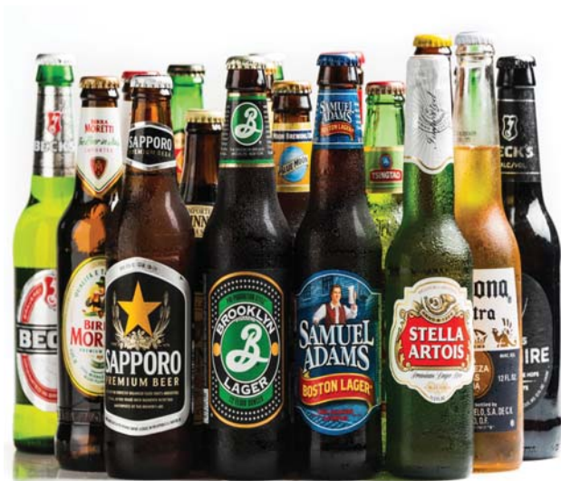
Iced Cold Beers 3.75

Sweet rice and black-eyed peas topped with creamy sweet coconut milk • 3.5