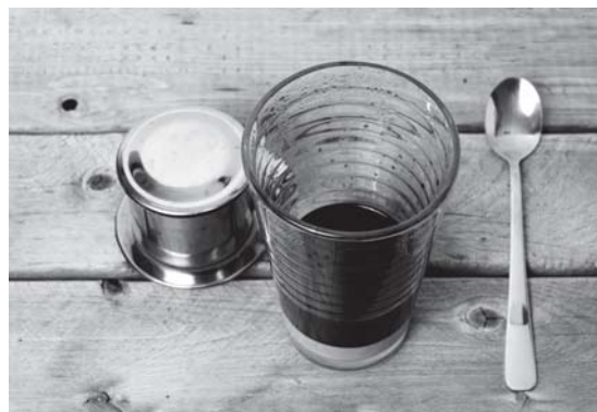
D2/3. Café Den/Café Sua