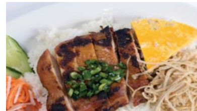
R3. Com 3 Items Custom (BBQ Chicken, Meat Loaf & Pork Rind)