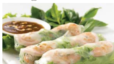
A2. Spring Rolls (Served with Peanut Sauce)

Consuming raw or undercooked meats, poultry, seafood, shellfish, or eggs may increase your risk of foodborne illness, especially if you have certain medical conditions