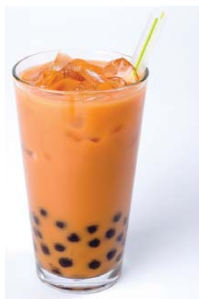
D7. Tea Boba