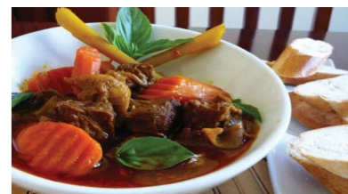
R9. French origin beef stew

Consuming raw or undercooked meats, poultry, seafood, shellfish, or eggs may increase your risk of foodborne illness, especially if you have certain medical conditions