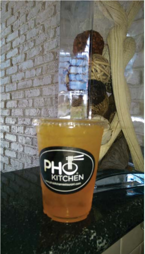
Royal Passion Fruit