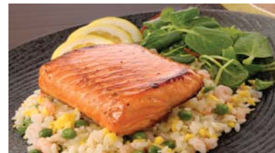
R4. Grilled Salmon (8oz) & Rice